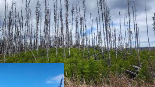
(post fire regrowth)