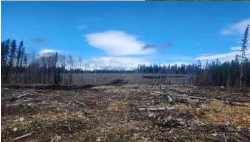
(old clear cut block)