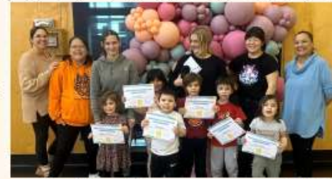
Making banock with an Elder